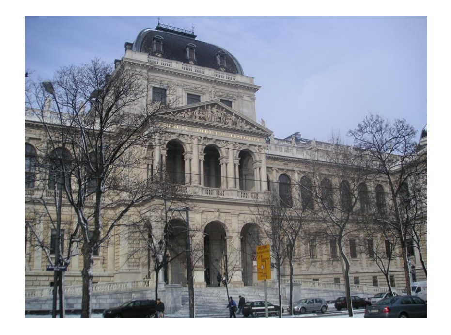
hosted by: University of Vienna, Austria